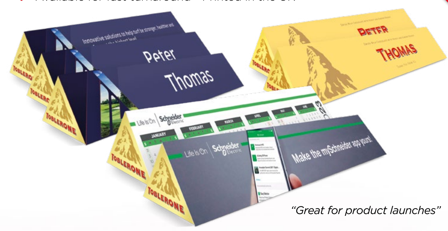
MAILING SERVICE AVAILABLE