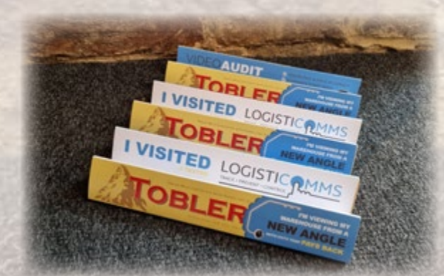
Branded Toblerones - Gift designed to encourage visitors and create a memorable visit to their exhibition stand