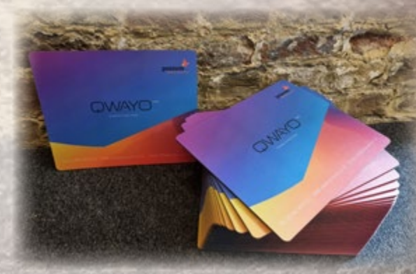
Qwayo - Branded AntiBac mousemats for the sales team and reps to give out