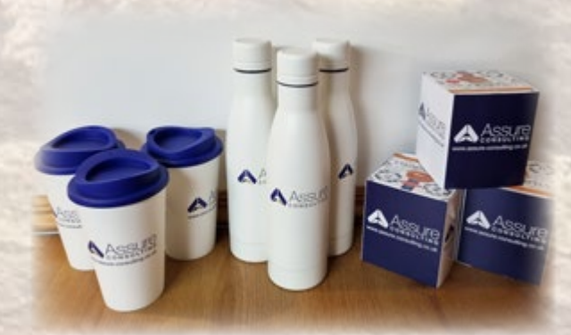
Assure Consulting - Assure Water bottles, Tumbler Talkers and Stroop Waffels to celebrate their 10th anniversary

Here's a few examples of recent branded gifts we've printed. If you would like a free visual, simply drop us a linem we're here and ready to help... sales@parkesexpo.com | 01767 603930