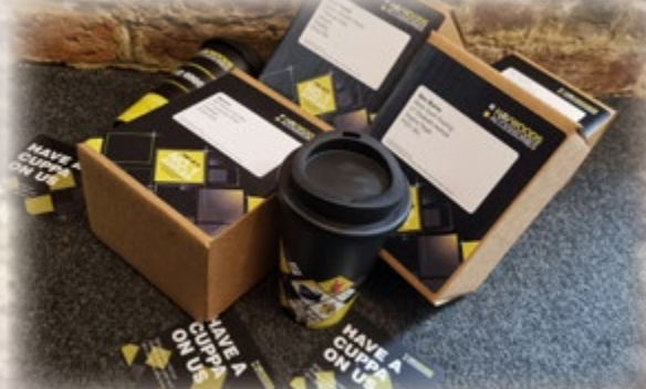
TumblerTalkers - Filled with chocolate, coffee & tea with branded card and mailed out to promote their new branch