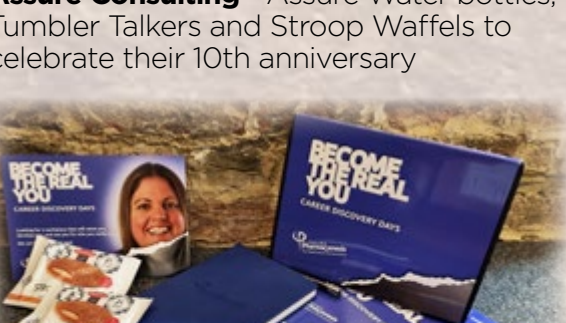
Career Discovery Day - Gift box mailed with notebook, pen and Stroop Waffels