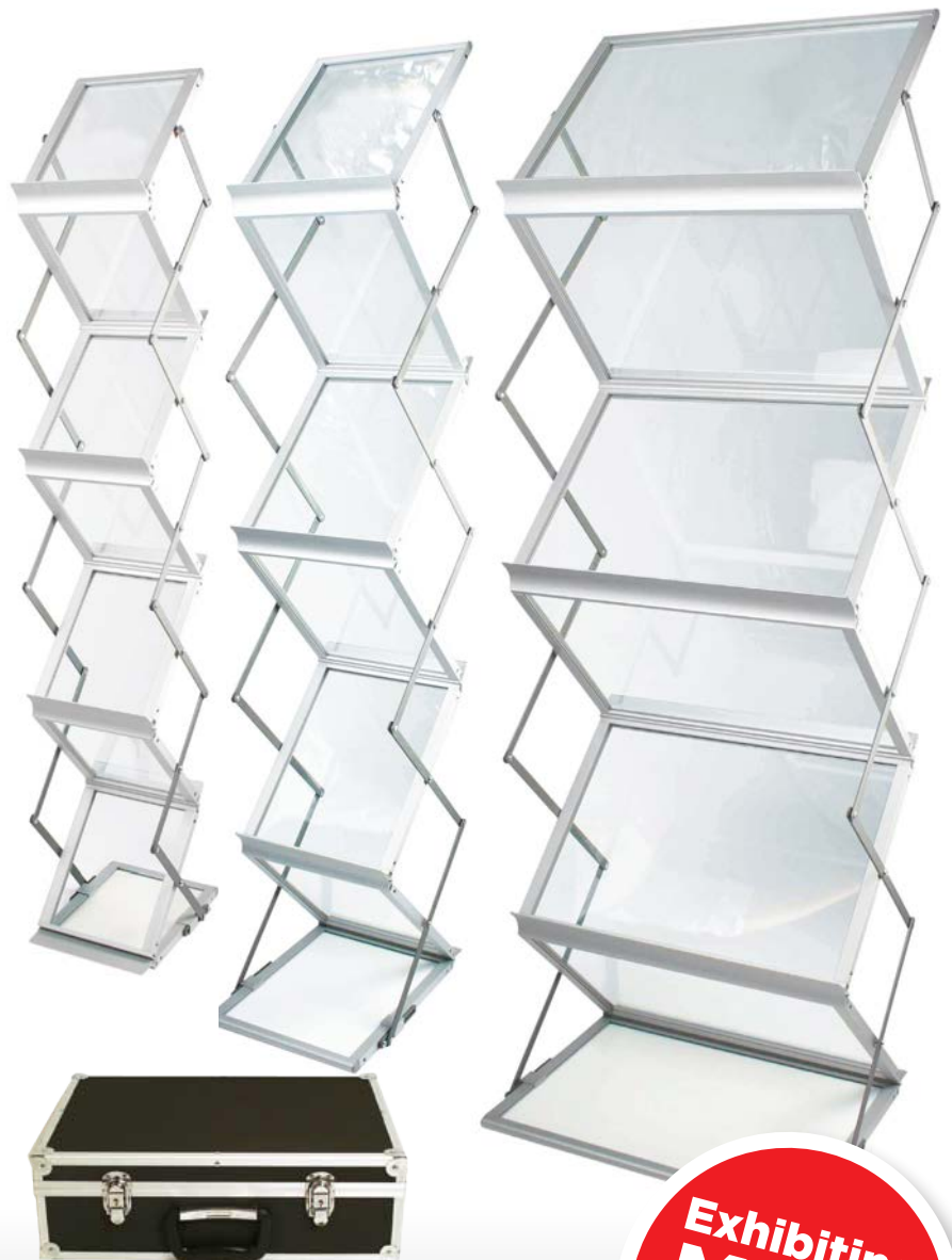
The Pied Avocet Literature Stand