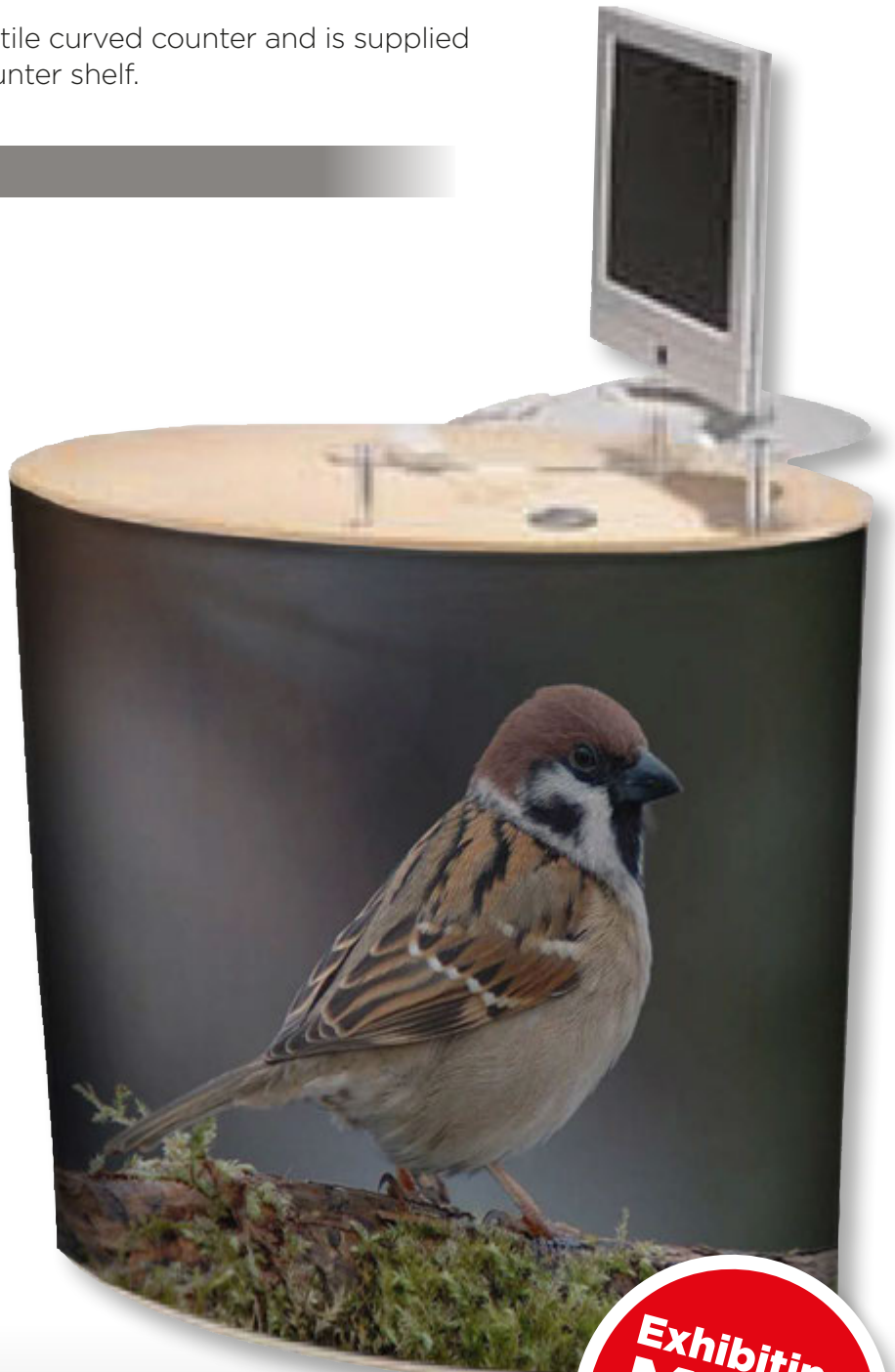
The Sparrow Indoor Workstation