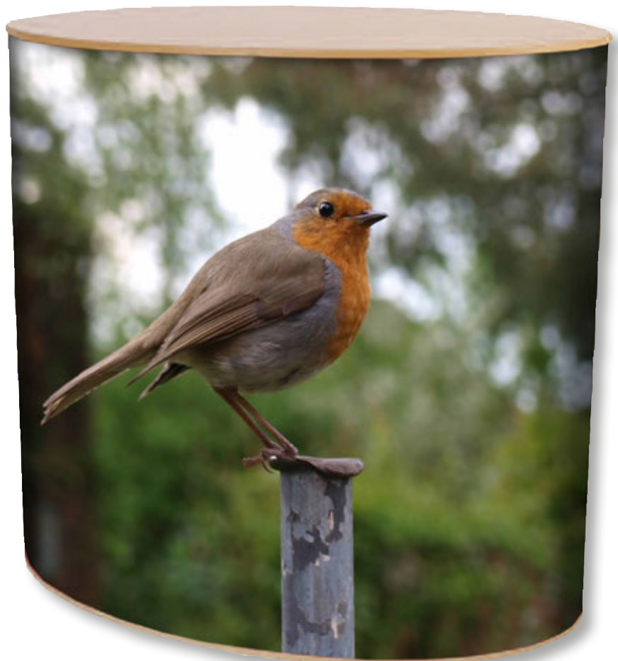
The Robin Indoor Workstation