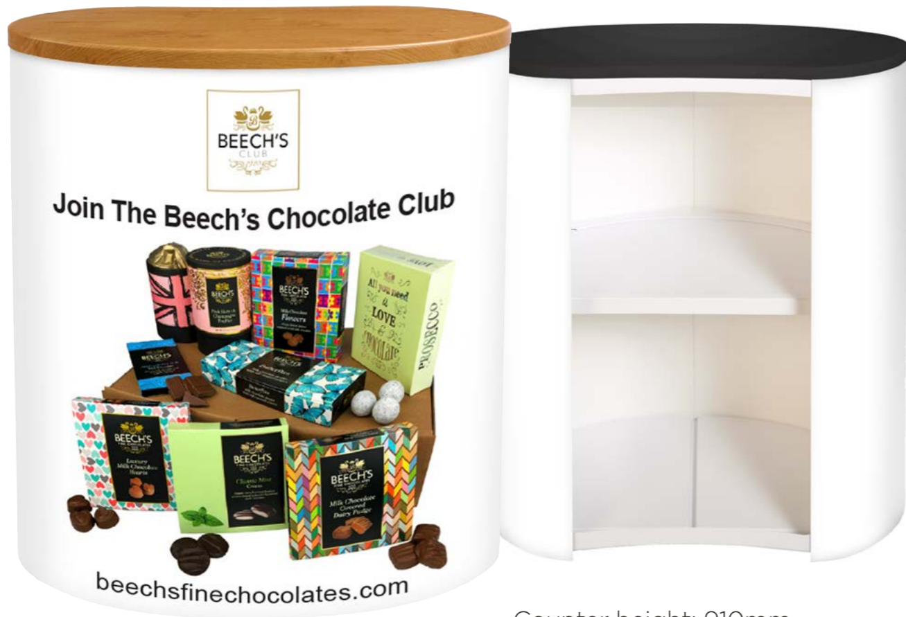
Counter tops various colours

Lightweight product for ease of transportation from one venue to another, weighing only 8.25 kg including all components and graphic with graphic tube