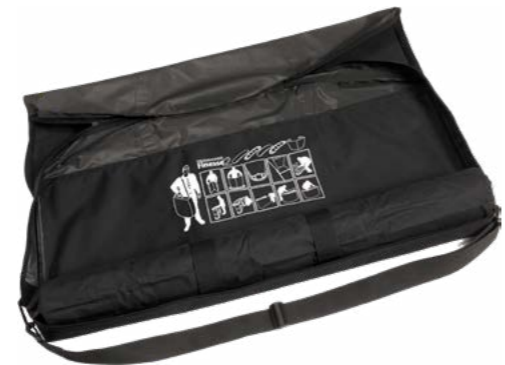
Counter and graphics all fit into the carry bag with shoulder strap.