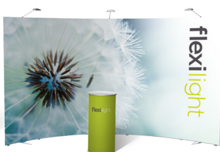
5x panels with counter (w) 4000mm