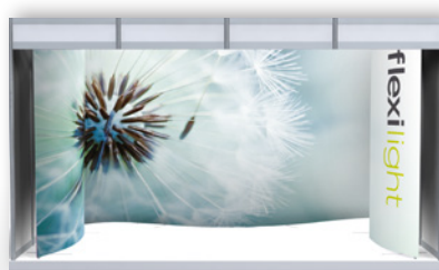
11x panels in shell scheme 4m x 3m (3 walls)