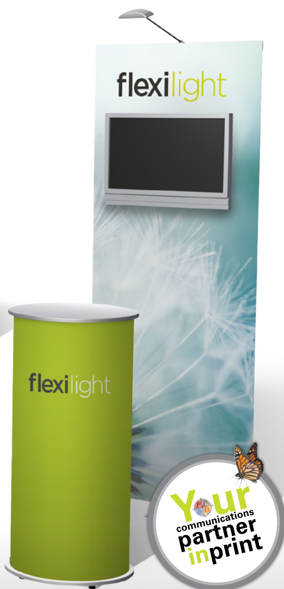
1x panel with counter (w) 800mm