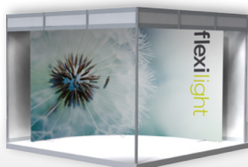
5x panels in shell scheme 3m x 3m (2 walls)