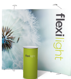
3x panels with counter (w) 2400mm