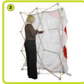
3 Push the frame tubes together to fully extend the system.