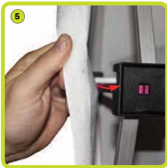
5 Wrap both vertical graphic ends tightly around the frame and fasten using hook & loop fastener.