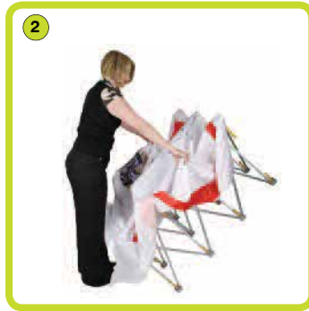
2 Continue to expand the frame until the graphic image appears.