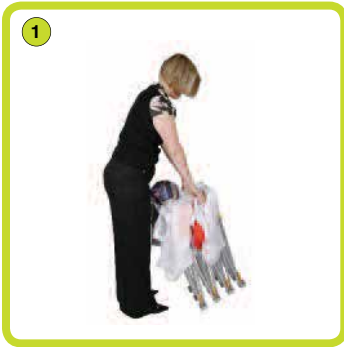
1 Hold the frame vertically and begin to expand outwards.