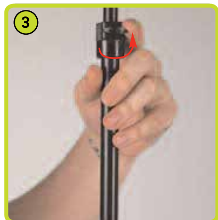
Lengthen the pole by pulling out to the desired height and then twist the thumb screw to secure pole into place