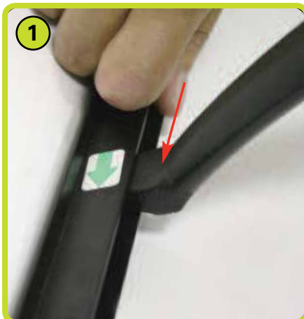
Take the stabilising foot and slide into the bottom rail in the direction of the green arrow until it is centrally positioned and locked into place.