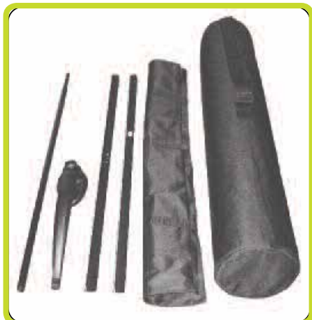
Kit includes: top rail, bottom rail, stabilising foot, telescopic poles, wrap and carry bag/tube