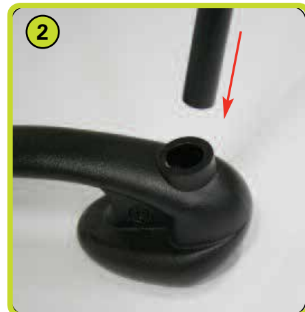
Slot the bottom of the telescopic pole into the foot.