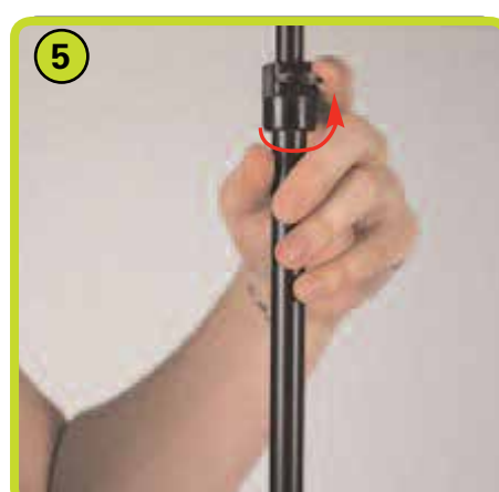
Repeat Step 3 if necessary to tension the graphic image.